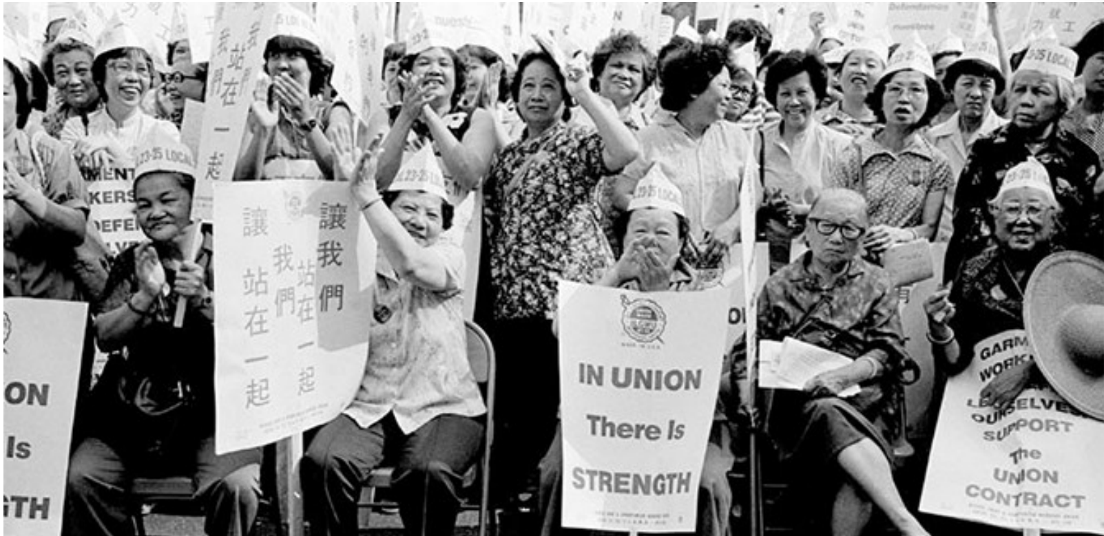
Chinese immigrant women and members of ILGWU Locals 23-25 on strike, New York City, 1982