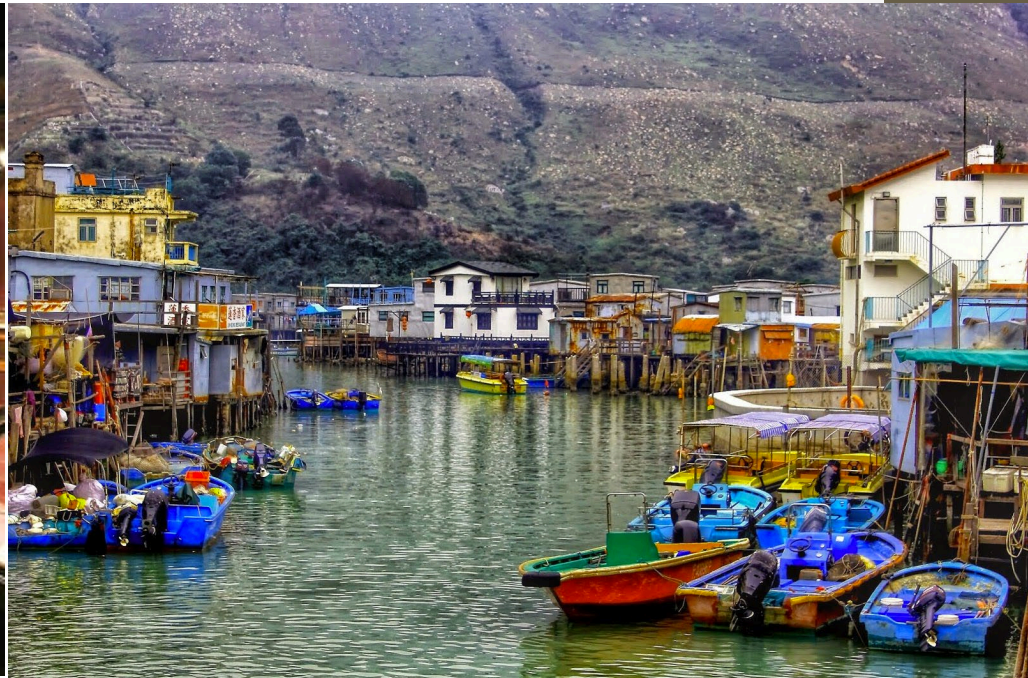
Tai O Fishing Village