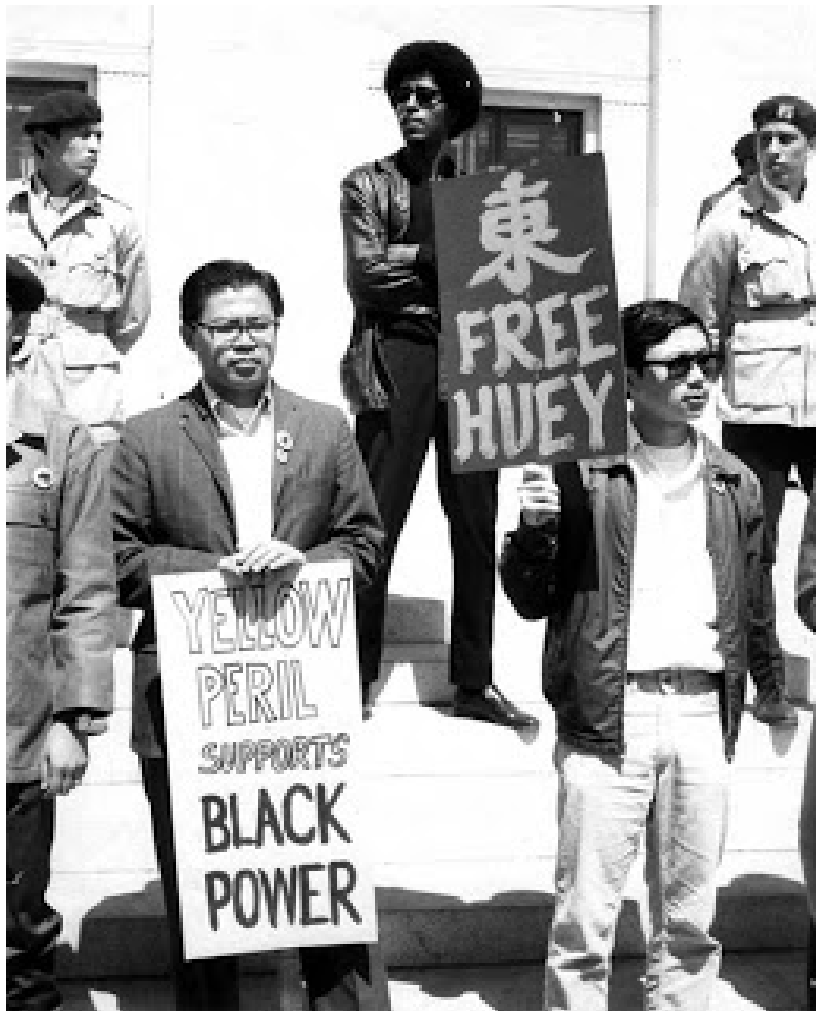
Free Huey campaign, Oakland, 1969