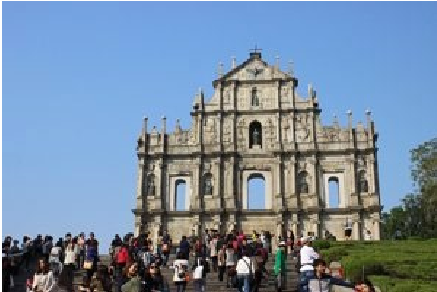
Ruins of St. Paul, Historic Centre of Macau