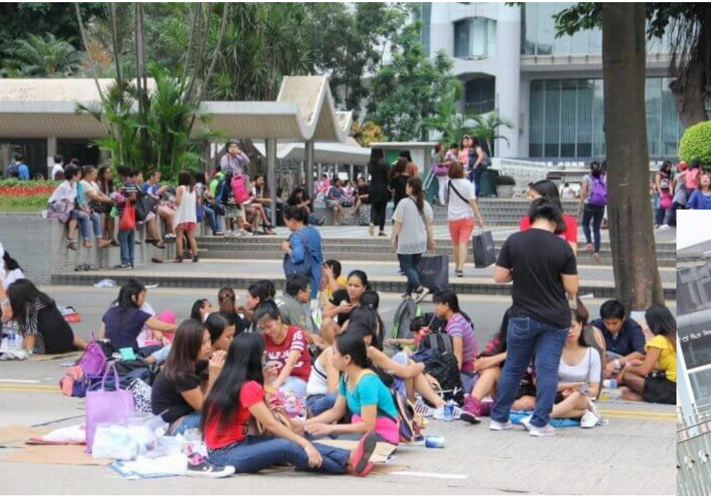
Filipina domestic workers, Central Station