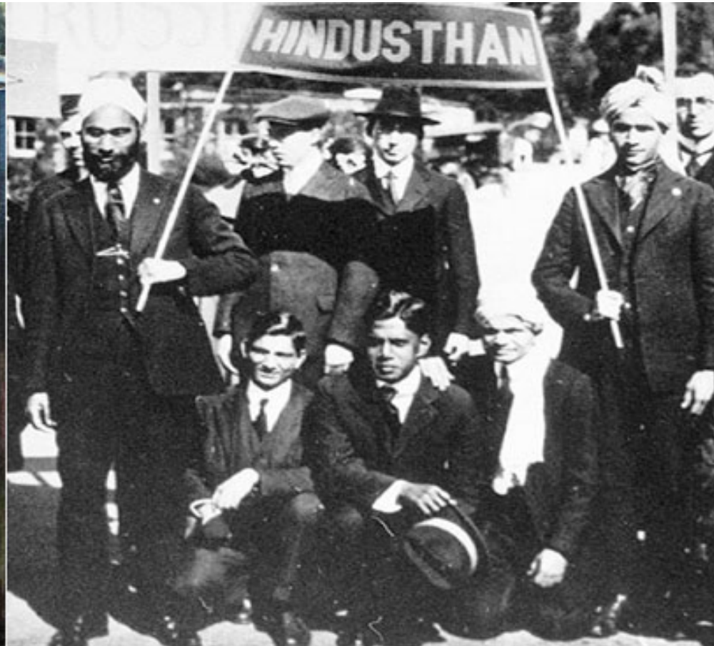
Ghadar Party, circa 1917