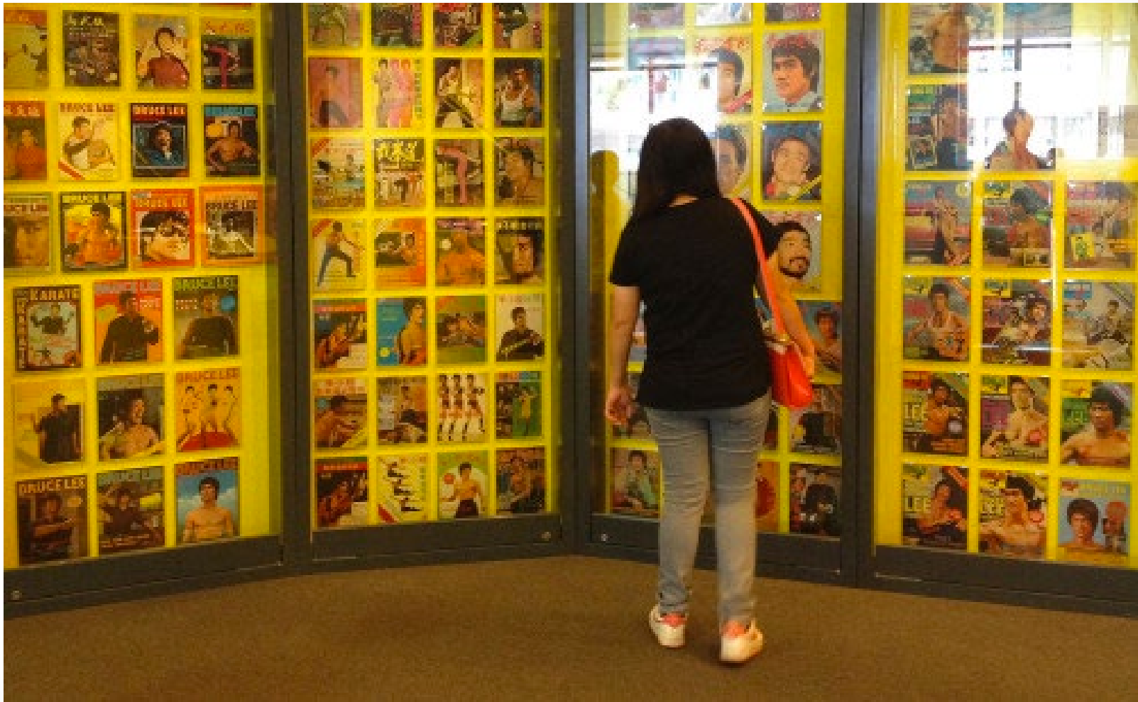
Bruce Lee exhibit, Hong Kong Heritage Museum