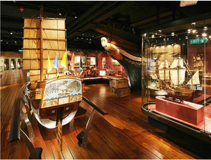
Maritime Museum of Hong Kong